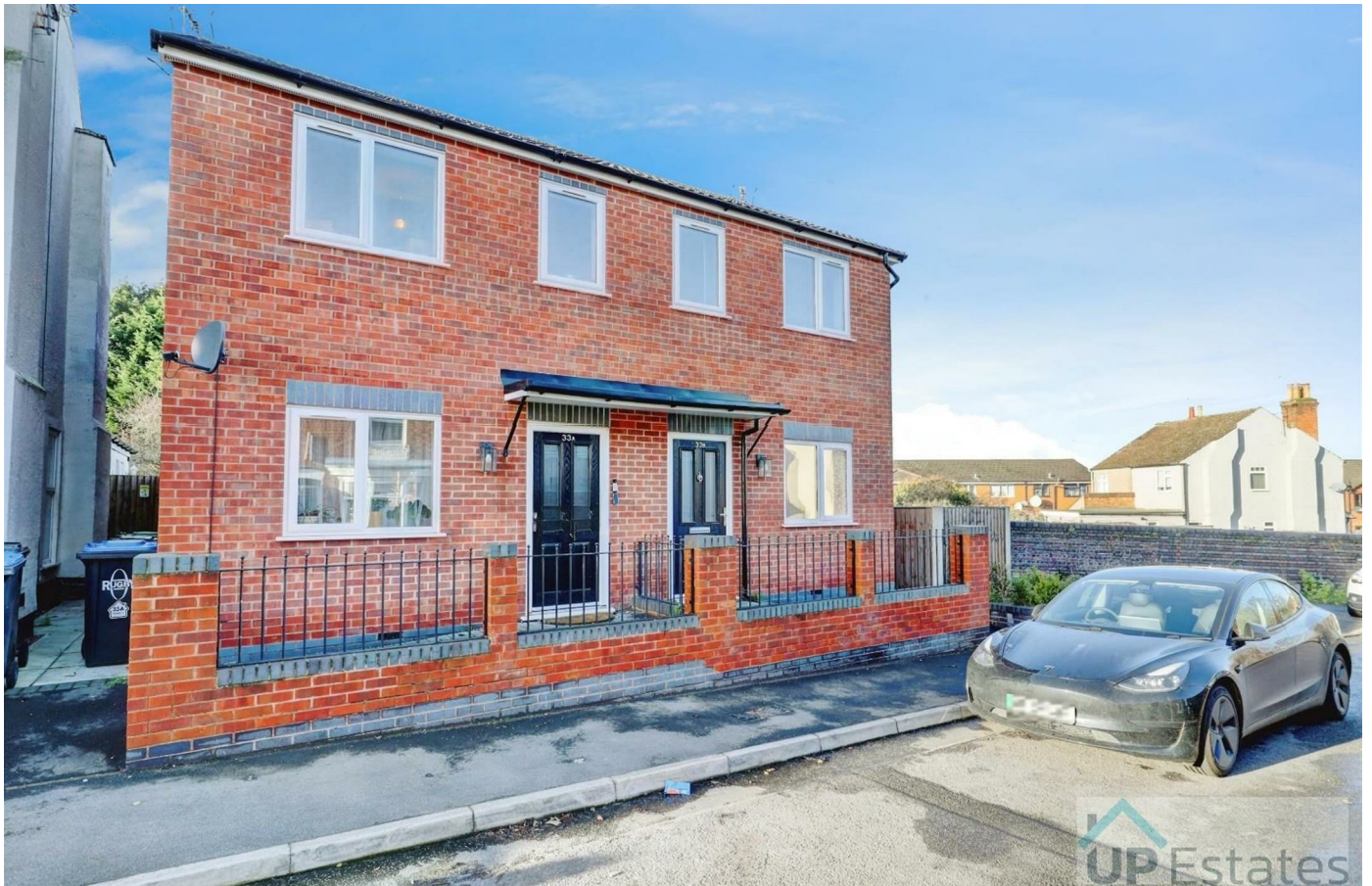
Rokeby Street, Rokeby Street, Rugby